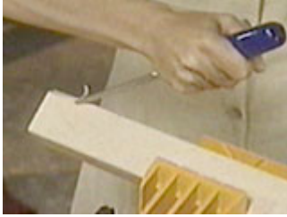
Make a flat spot on the inside corner of the legs

While the glue is drying, mark the approximate height of the apron on the inside corner of each leg. Remove each leg and chisel a flat spot on the inside corner of each leg mid-way between the apron line and the top of the leg.