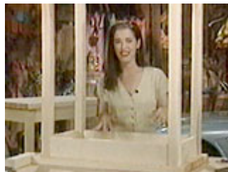
Put all the apron pieces in place and number them according to their location