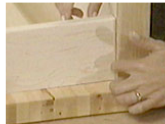
Inset the apron about a quarter of an inch

Put the apron pieces in place between the legs. For eye appeal, inset the apron pieces about 1/4". Mark a pencil line along the inside edge each apron piece. Then set aside the apron pieces and legs.