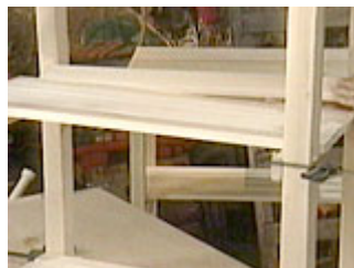
Space the shelf boards evenly and screw them down