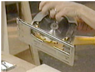
Set the depth of the blade to fit the brace

Put the legs and apron pieces in position. Set the heavy-duty leg braces on top of the apron at each corner. The brace must be well-centered in relation to the leg! Mark the location of the slots required by the brace.