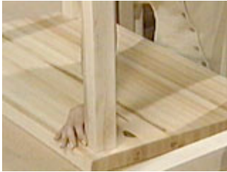
Locate the legs on the bottom of the cutting surface