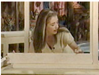
Put the apron lumber in place and mark it for cutting

Next, turn the cutting board upside down. Place the legs in the corners. They should be set in from the edges about 1 1/4". Trace the outline of each leg position. Now measure the dimensions between the marks to determine how long to cut the apron pieces, then cut 'em.