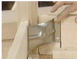
Cut the slots for the leg braces