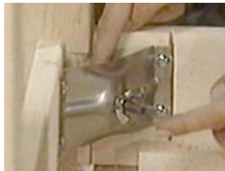
Attach the bracket in place with four screws

Now cut the slots in the apron using a circular saw with the blade set to a depth of about 3/8" (check the depth required by the flanges on your braces).