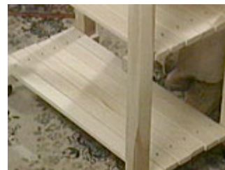
Shelf boards in place

Install 1" x 2" shelf supports and attach the shelf boards, pre-drilling so you don't split the wood.