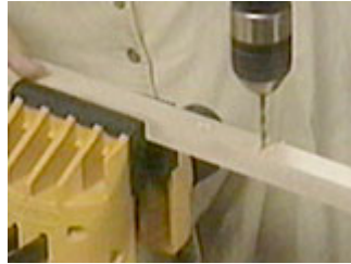
Drill holes every three inches for the screws