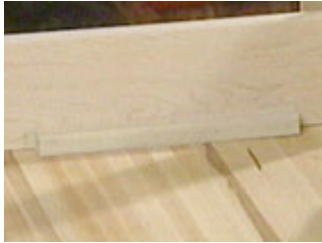
Make one-inch strips to support the apron