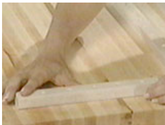
Put the blocks in place and attach with screws

In the 1" x 1" strips, pre-drill holes every 3". Screw the strips to the cutting board, attaching them along the inside of the apron line.