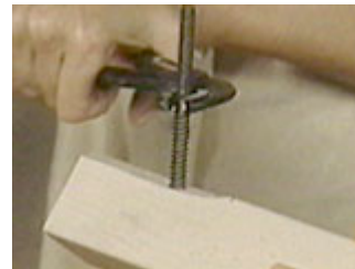
Drive it in with tongue-in-groove pliers