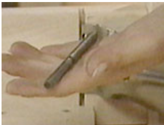
Use the hanger bolt to mark the location to drill

While the glue is drying, mark the approximate height of the apron on the inside corner of each leg. Remove each leg and chisel a flat spot on the inside corner of each leg mid-way between the apron line and the top of the leg.