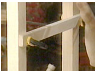
Clamp the shelf supports in place and screw them to the leg

Install hanger bolts and secure them with washers and nuts.