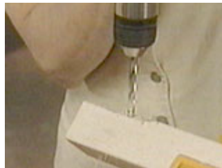
Drill for the hanger bolt