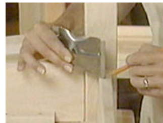
Set the brace on top of the apron to locate the slots