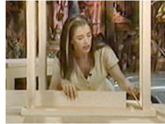
Mark their location