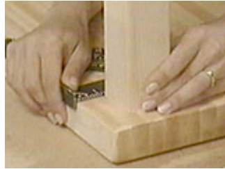
Be sure they are in exactly the right place