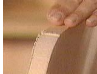
Look for any imperfections in the cut