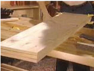
Lay the boards flat and clamp them together until used