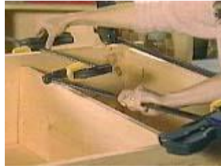
Use two clamps together if one is not long enough

Lay the back on a flat solid surface, stand the sides up with a shelf or two in between them and clamp them in place. This can be pure hell if you're working alone. Phone a friend!