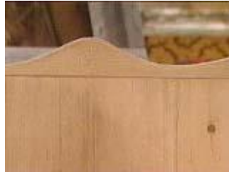
Finished trim at the top on the back with Victorian carving

When the bookshelf is all together, stand it up on the floor. Measure the space at the top both for length and depth. Transfer those dimensions to a 1" x 4" piece of pine. Draw out the shape of the top, fitting it within the sides. The ends of the top trim piece should be the same height where they meet the top of the sides. You can use the three-hump model Mag chose for her trim piece, or any other wavy shape you like.