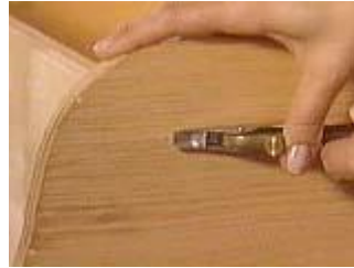
Lift a shaving of wood in the place where the nail goes