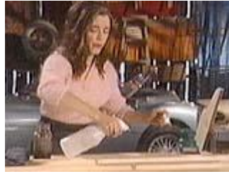
Control the depth of the color with additional water