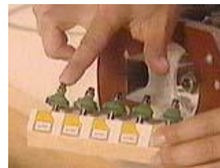
Choose a bit for the trim and rout an edge on the bottom trim piece

Route a 'V' groove in the back at the joint where the boards are glued together. You will have to make a guiding 'fence' for the router, because otherwise you'll be all over the place with the router.