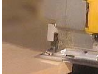
Cut out the shape with a jig saw and scrolling blade