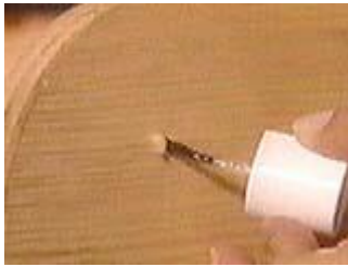
Glue the shaving back in place with high-tack fish glue