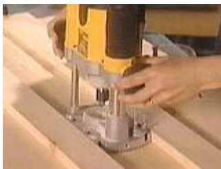
Set up a guide fence on either side of the router for the 'V' groove

Route the edge of the second sidepiece and the front edges of three of the shelves with the beading bit. Then sand the edges and the surface before finishing. Because pine is quite fibrous, the end-grain is often a bit hairy after routing, and needs a good sanding.