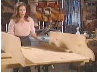
After staining, clamp the side pieces and shelves in place