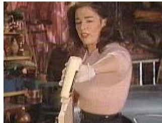
Glue and clamp together the three pieces for the back

Cut the three boards for the back to a length of 48". Glue and clamp them together. Be sure that the ends line up well. If they don't line up easily, choose one end for the top and make it as even and perfect as possible. The top trim will sit on that edge and will show any deviation.