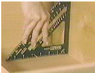
Square the shelves to the back