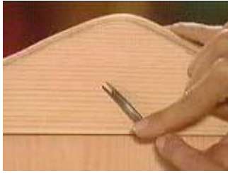
Carving on the top trim with a 'v' carving tool