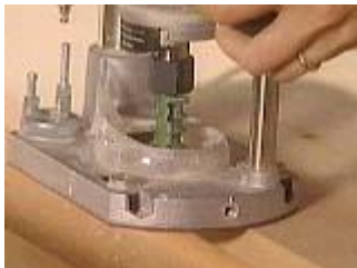
Plunge router with beading bit

Don't force the blade through the wood any faster than it wants to go. Any dips and bumps will transfer to the router, so they must be sanded down. Use a palm sander or sand paper on a small block to take out any imperfections. Repeat on the second side piece.