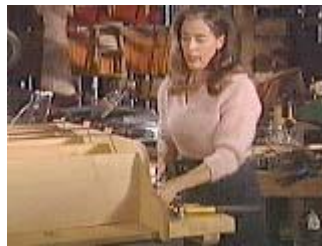
Shelves squared, clamped and ready for nailing

Measure the space between the shelves using the books you intend to use on them. Eleven or twelve inches between shelves usually works well. Make an unobtrusive mark and set the shelves in place.