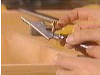
For blind nailing, use a tiny plane