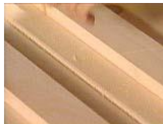
Test for depth and rout a groove along each joint on the back