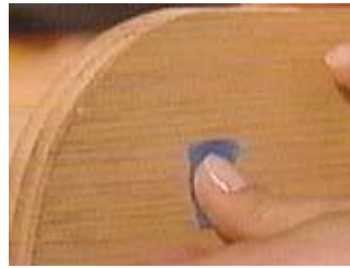
Use tape to hold it in place while it dries

Blind nailing is a technique of lifting a sliver of wood using a tiny plane and driving a finish nail under it. The sliver of wood is then glued down again using fish glue, which doesn't stain the surrounding wood. If done correctly, this technique can be quite unobtrusive. However, it takes a bit of practice to make it work well. Blind-nailing kits are available in Canada from Lee Valley - Invisible Nailing Kit .