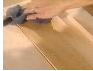
Wipe off excess with a rag