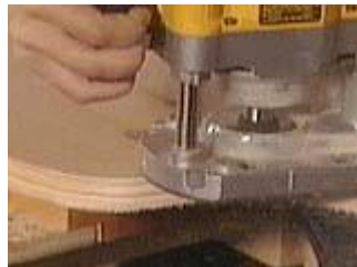
With a beading bit, rout the edge of the side pieces and the front edges of the shelves

Rout the edge of the curved sides with a beading router bit. Read all the instructions and be sure to unplug the router when changing or adjusting bits. Each router is different, so please do read the instructions, or take a course in using a router if you want to be a star routerperson.