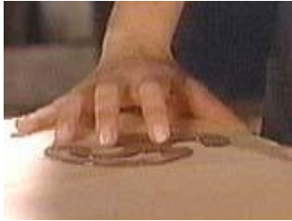
Draw the desired curve for the sides using a French curve