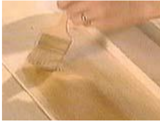
Apply a water based aniline stain with a brush